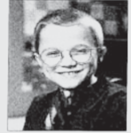
"Remember to Play After Every Storm." Mattie J.T. Stepanek