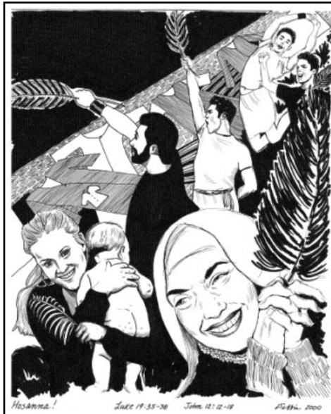
Hosanna! Luke 19:35-38 John 12:12-18 April 2000 Hosanna!

With Palm Sunday, we begin the holiest week of the year. It is also liturgically my favorite week of the year. I hope that you will join us for prayer frequently this week, especially for the celebration of the Sacred Triduum , literally the "three days". The liturgy that begins with the celebration of the Lord's Supper Holy Thursday evening simply continues on Friday as we observe the Lord's Passion , and culminates in the celebration of the Easter Vigil after dark on Holy Saturday night. The Church looks at the Triduum as one liturgy in three separate movements. If you have never celebrated the Triduum in its entirety, you have cheated yourself of an awesome experience of the Paschal Mystery : Christ has died, Christ is risen, Christ will come again! This is the basis of our faith.